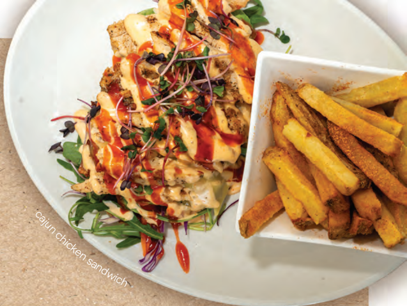
cajun chicken sandwich