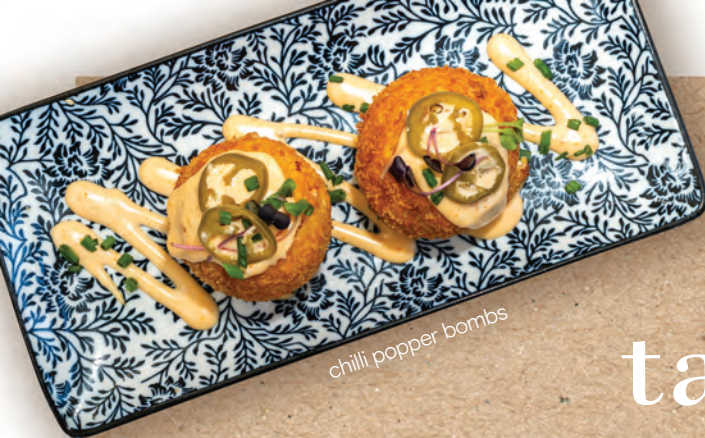
chili popper bombs