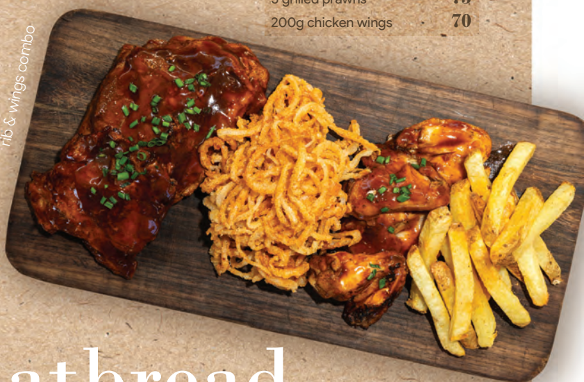
rib & wings combo