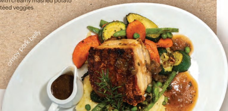
crispy pork belly