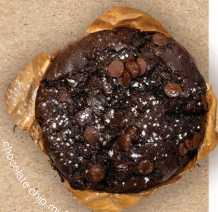
chocolate chip muffin