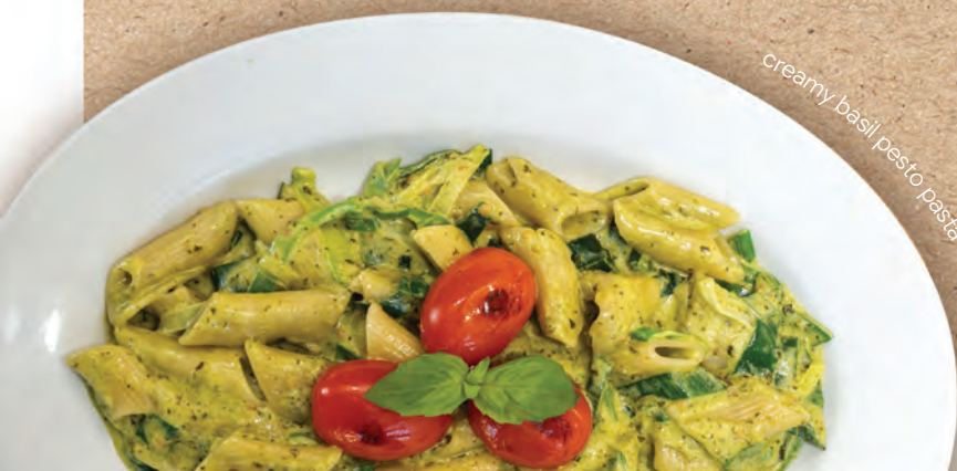
creamy basil pesto pasta