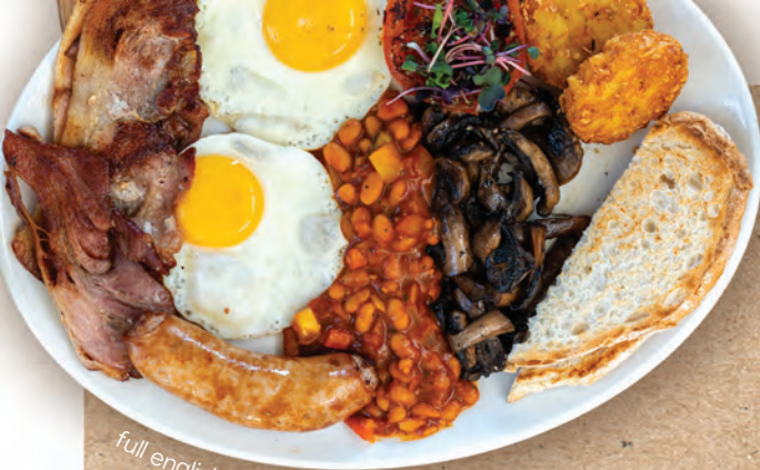
full english breakfast